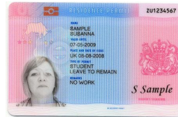
BIOMETRIC IMMIGRATION CARD