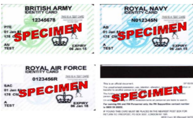
MILITARY ID CARD