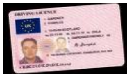
EU ID CARD