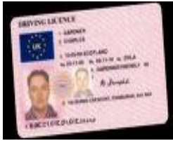
EU PHOTO DRIVER'S LICENCE